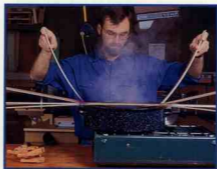
The author's steamer is a roasting pan filled with a bit of water heated on a Coleman camping stove. Only the middle of the \frac{1}{2} -in.-thick laminations are steamed before they're clamped around a plywood plug to form the frame.

My bending fixture consists of a \frac{1}{2} -in.-thick plywood plug screwed to a plywood base. The plug, which is the exact shape and size of the desired frame hoop, has holes drilled equidistantly around the perimeter to accept clamps (see the drawing on the facing page). To keep the frame from being glued to the base, I place a sheet of 0.5- or 1-mil. polyethylene between the plug and base. When band-