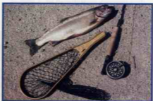
A steam-bent landing net is a welcome addition to any angler's gear. This bird's-eye maple and walnut frame holds a 28-loop bag.

sawing the plywood plug, I remove a \frac{1}{8} -in.-wide hoop of waste to allow space for the frame, so the outside scrap plywood can be used as clamping cauls. I bandsaw just outside the layout lines and then use a file and drum sander to smooth the edges of the plug and cauls to the lines.